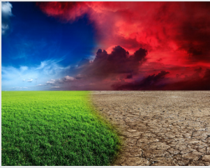
Default ICC settings